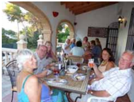
The whole group of guests